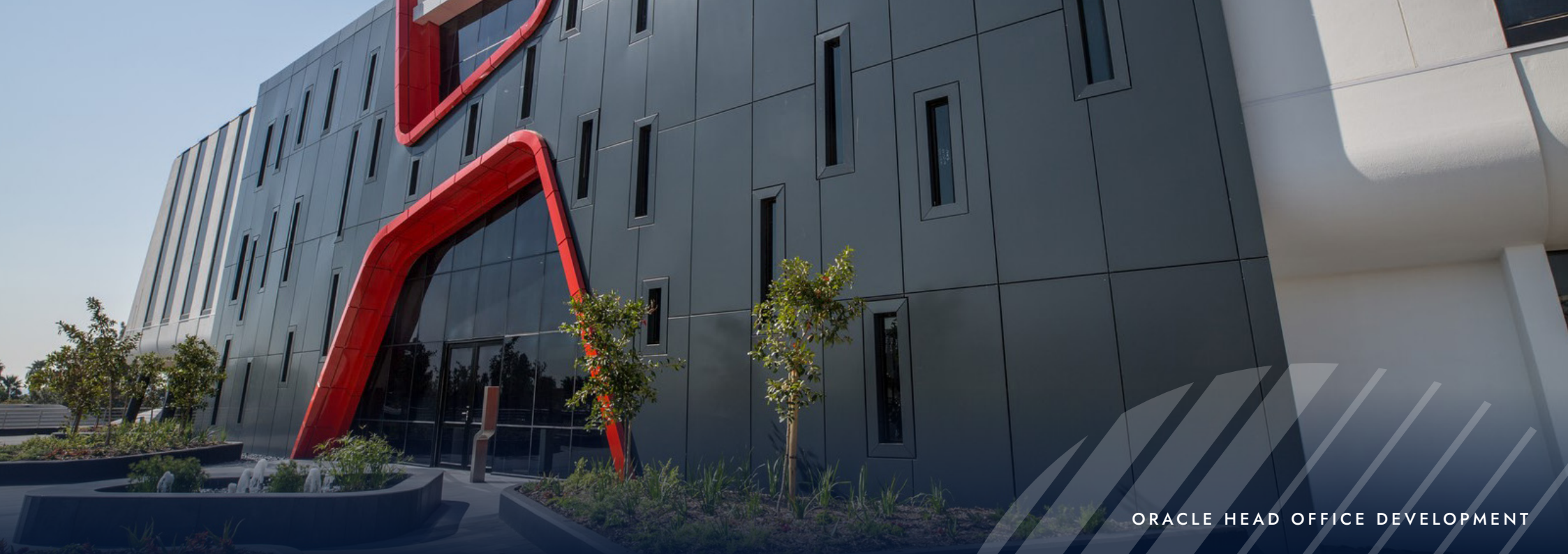
ORACLE HEAD OFFICE DEVELOPMENT