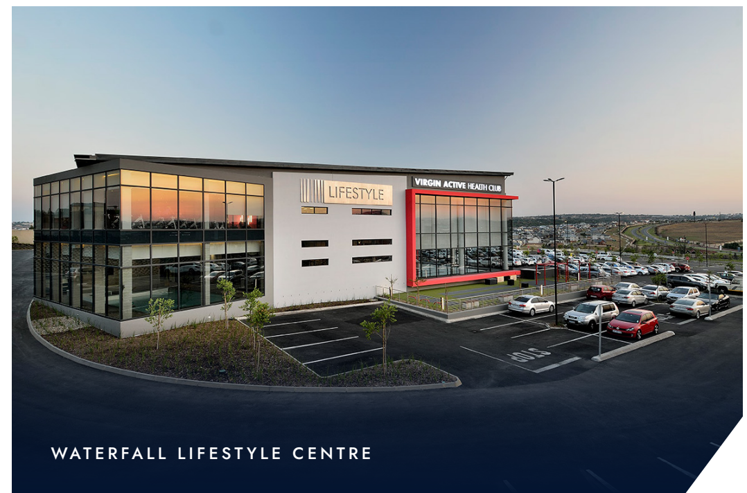
WATERFALL LIFESTYLE CENTRE