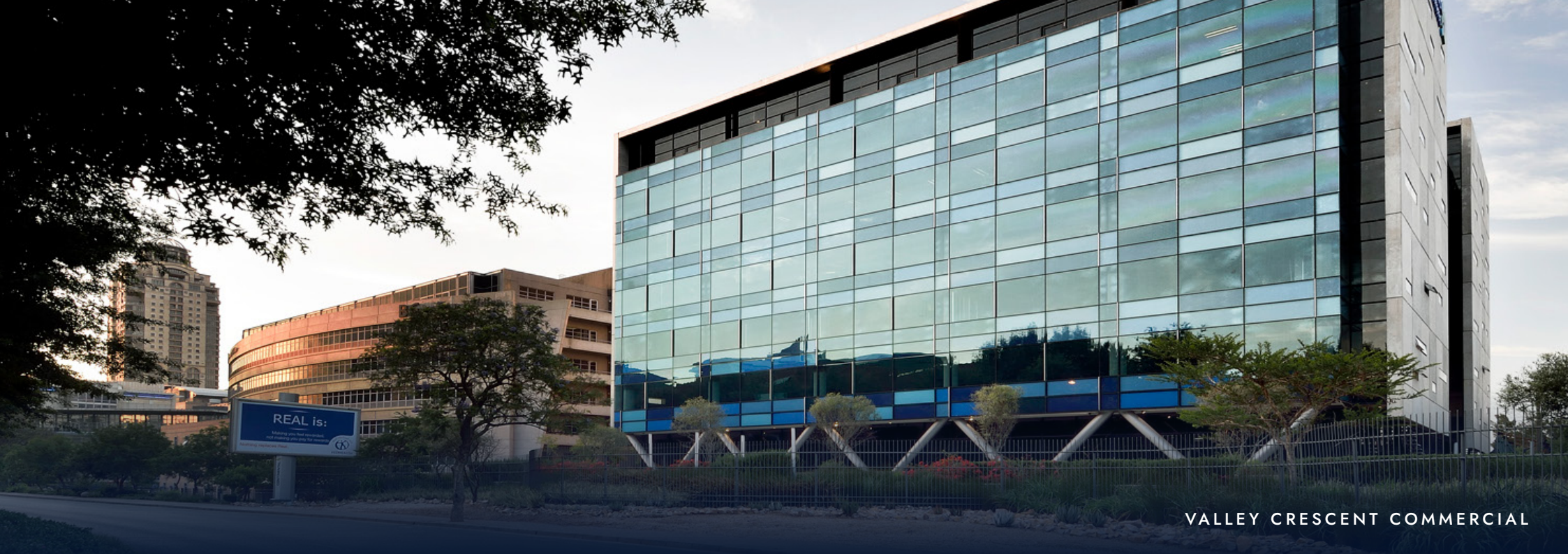
VALLEY CRESCENT COMMERCIAL