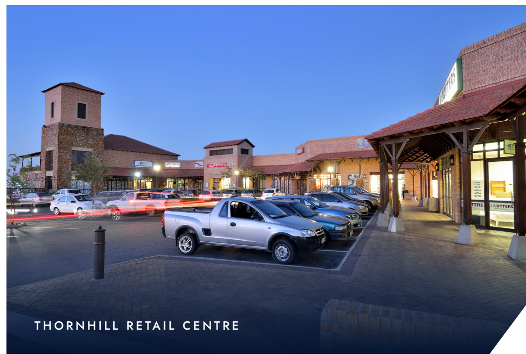
THORNHILL RETAIL CENTRE