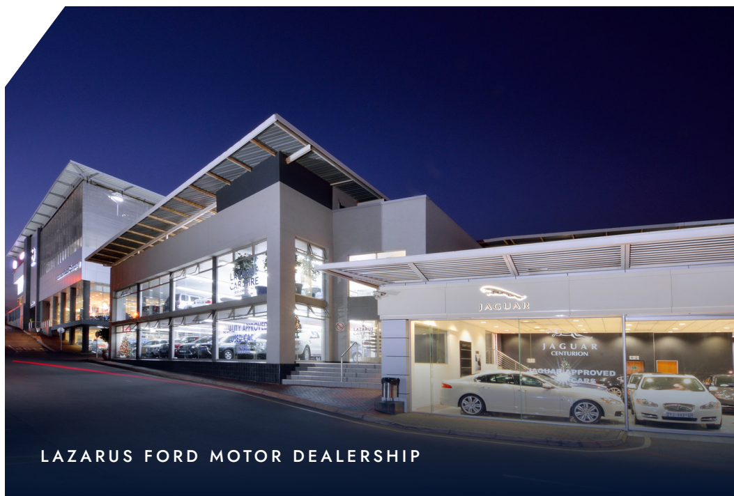
LAZARUS FORD MOTOR DEALERSHIP