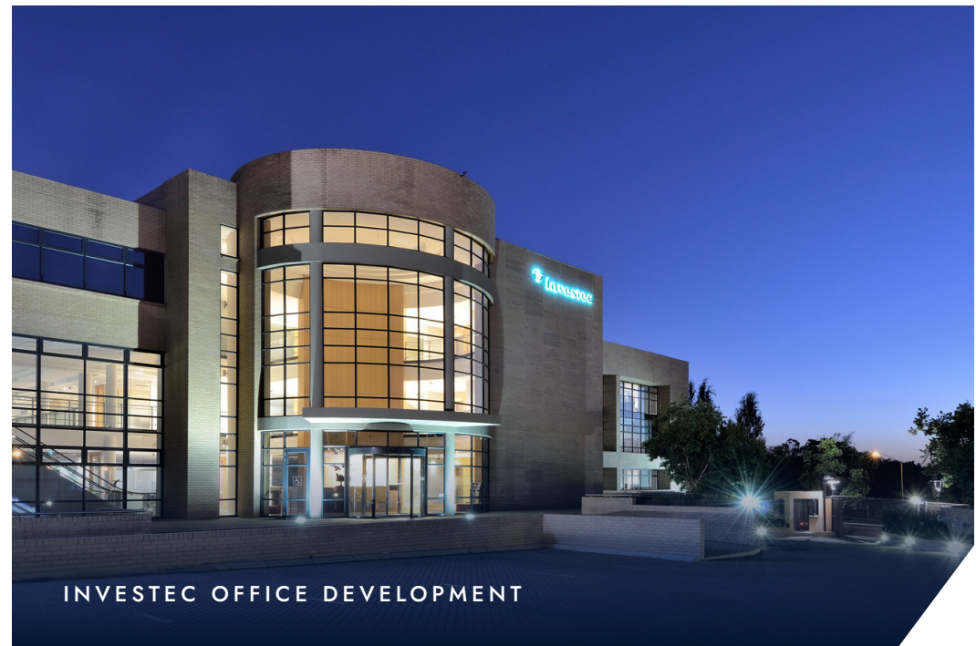
INVESTEC OFFICE DEVELOPMENT