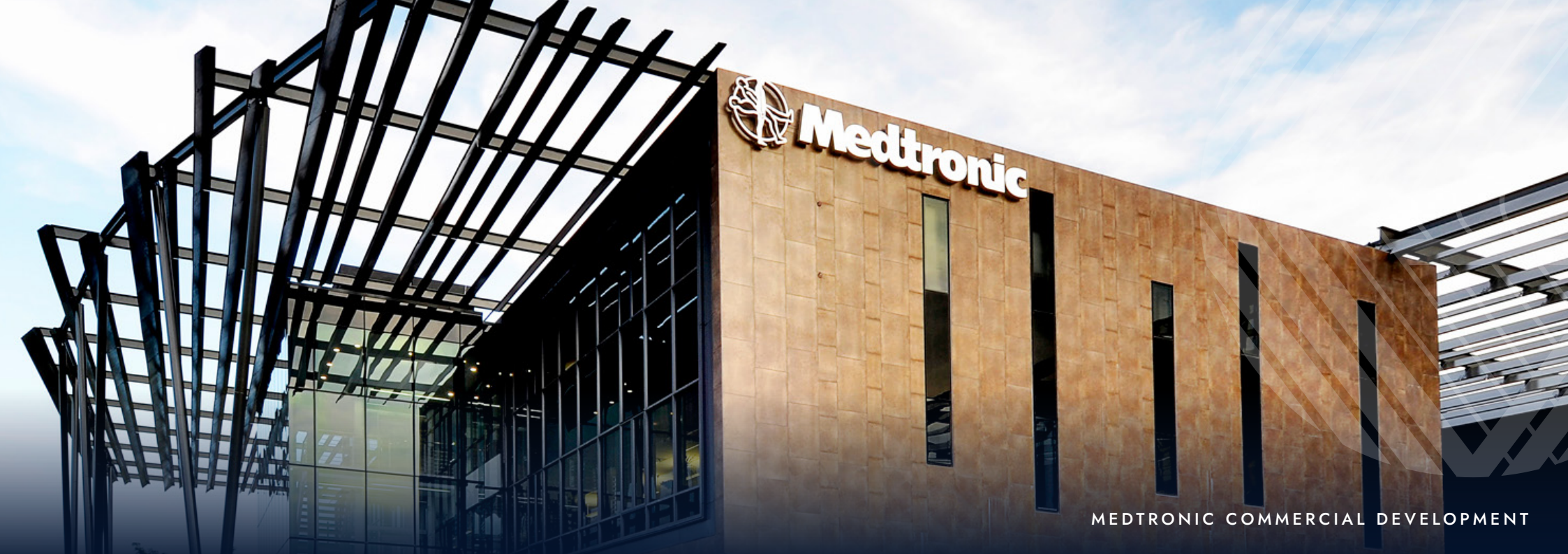
MEDTRONIC COMMERCIAL DEVELOPMENT