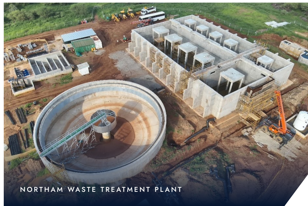
NORTHAM WASTE TREATMENT PLANT