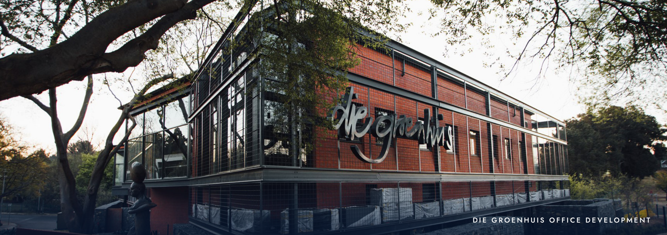
DIE GROENHUIS OFFICE DEVELOPMENT