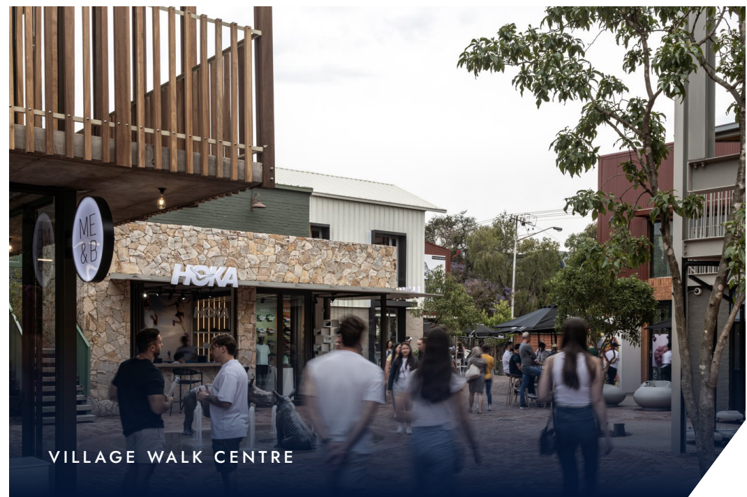
VILLAGE WALK CENTRE