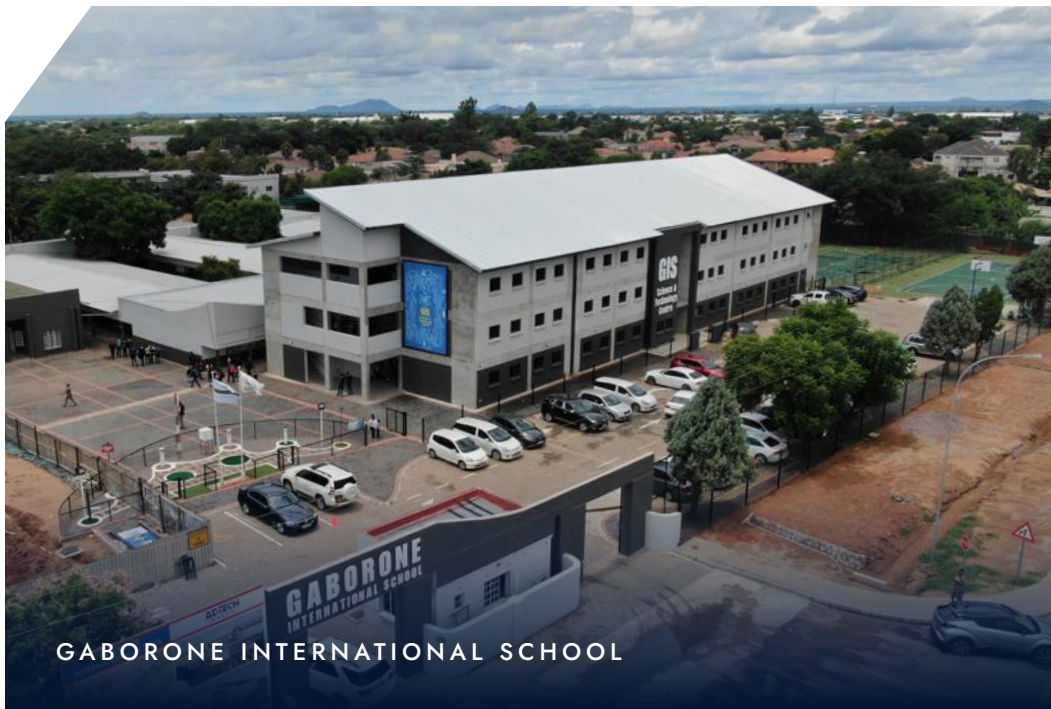
GABORONE INTERNATIONAL SCHOOL