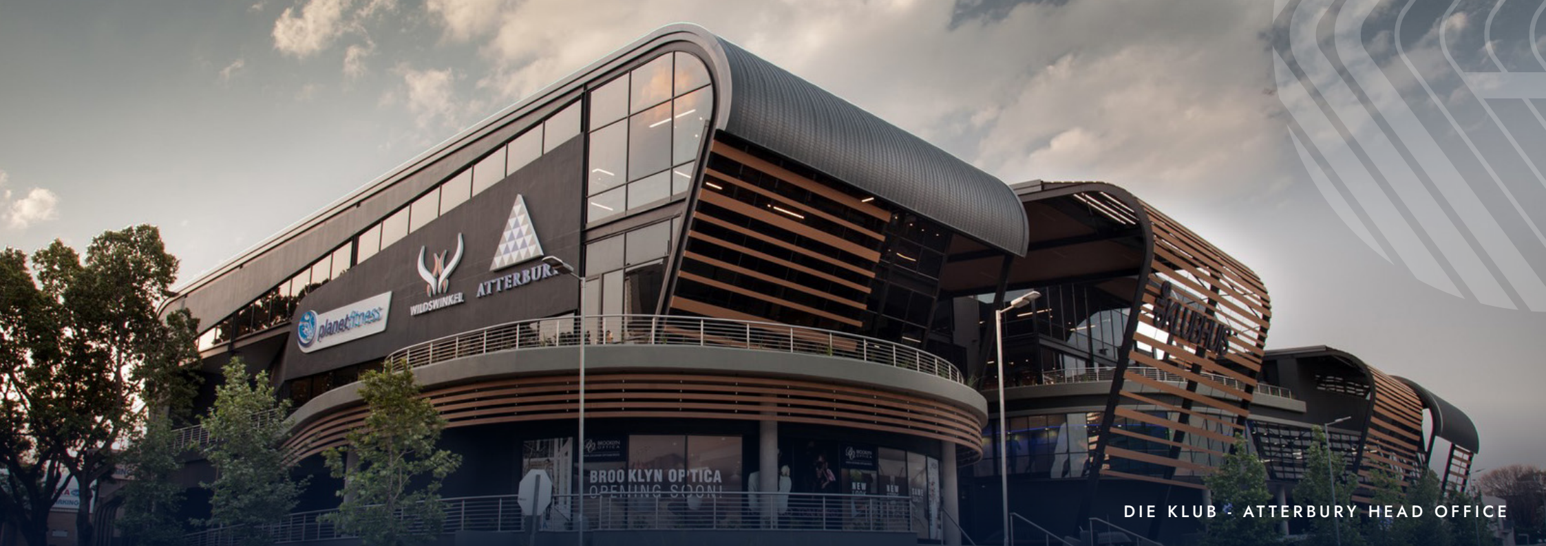
DIE KLUB • ATTERBURY HEAD OFFICE