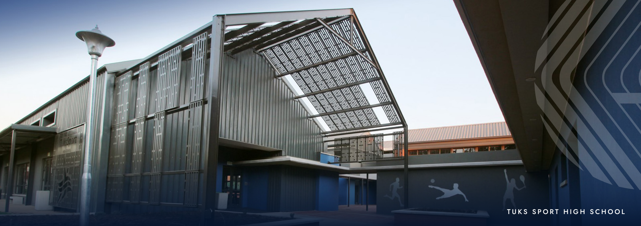
TUKS SPORT HIGH SCHOOL